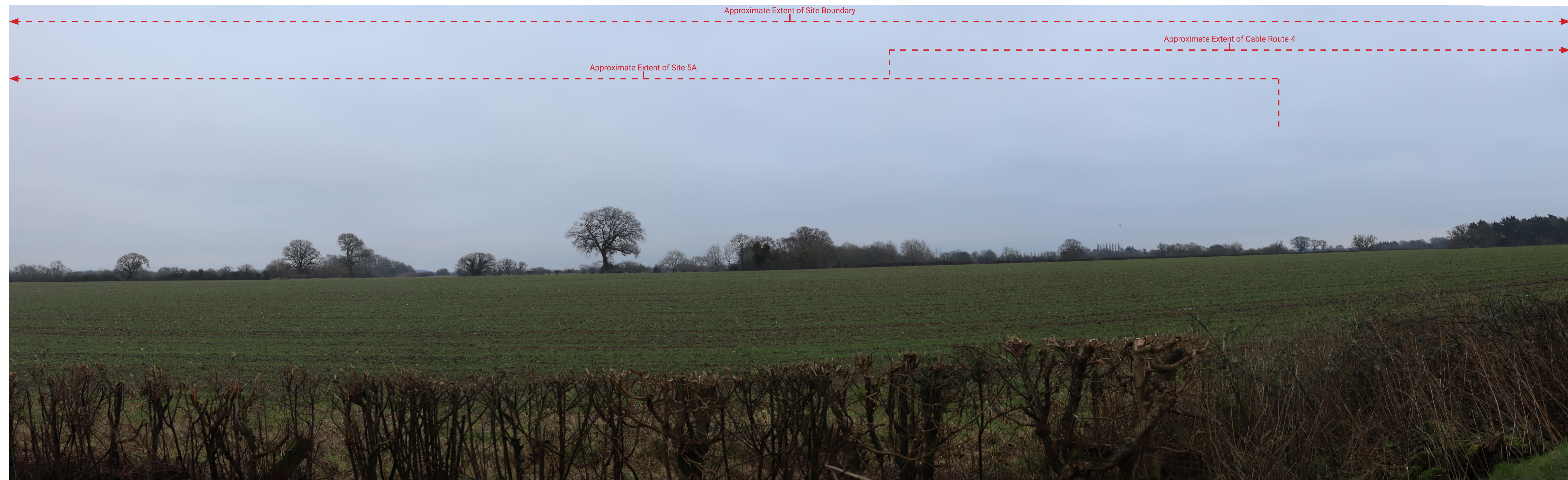
90° Horizontal field of view

This panorama is not to scale. For contextual information only