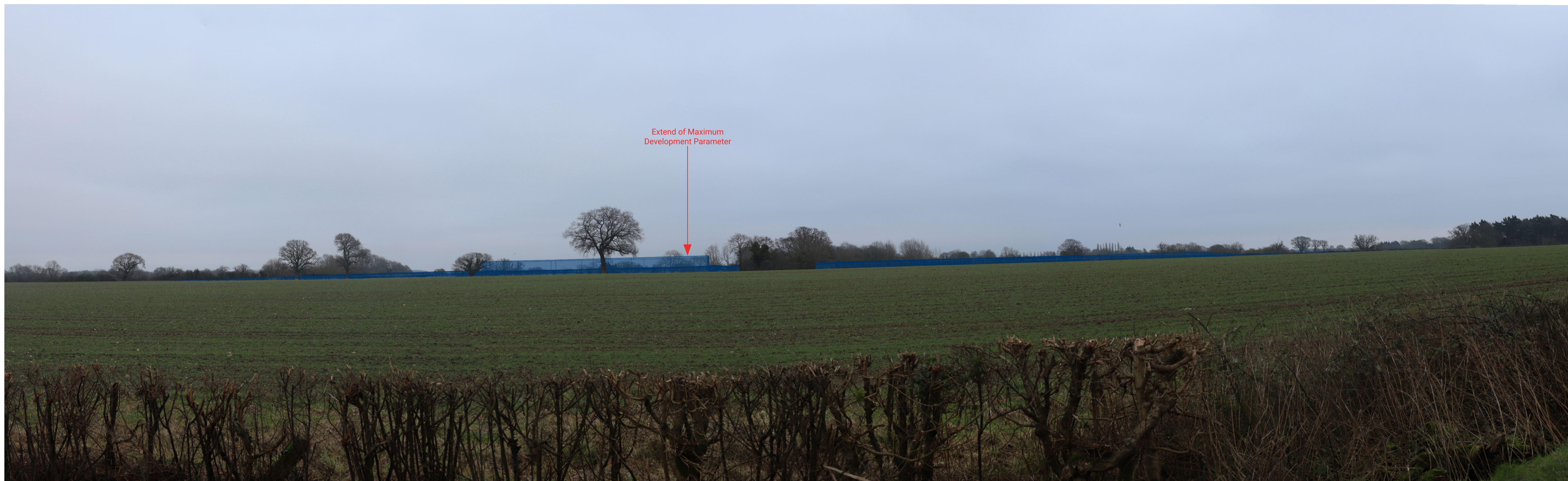
90° Horizontal field of view

This panorama is not to scale. For contextual information only