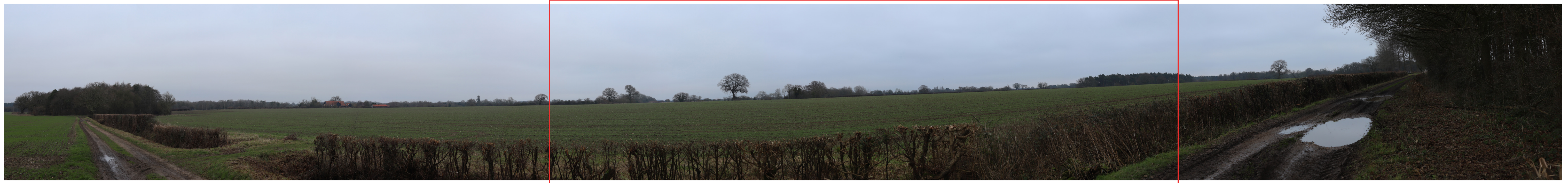
Site Context Photograph

This panorama is not to scale. For contextual information only