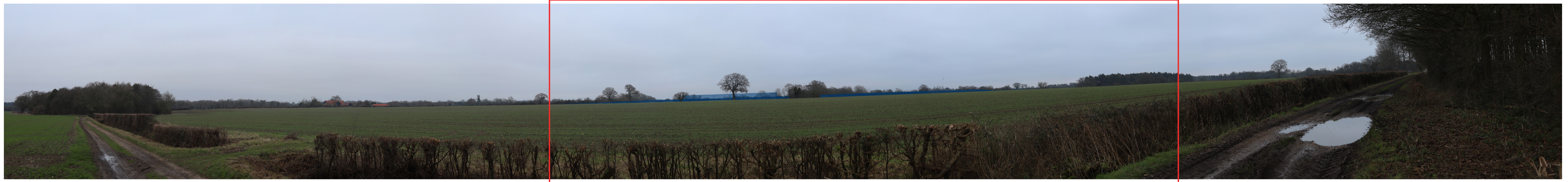
Site Context Photograph

This panorama is not to scale. For contextual information only